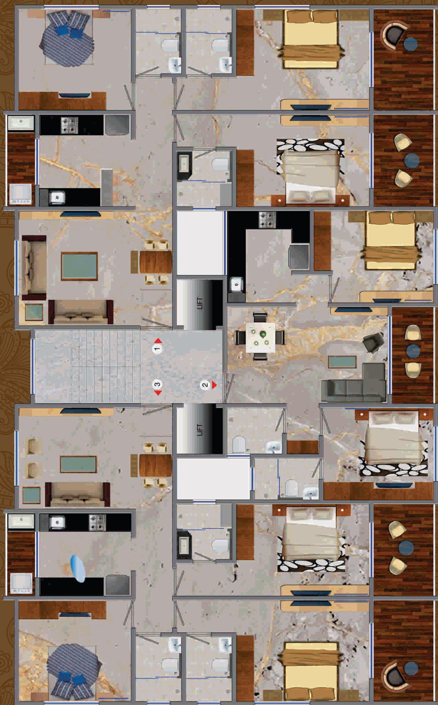
CONCEPTUAL FLOOR PLAN