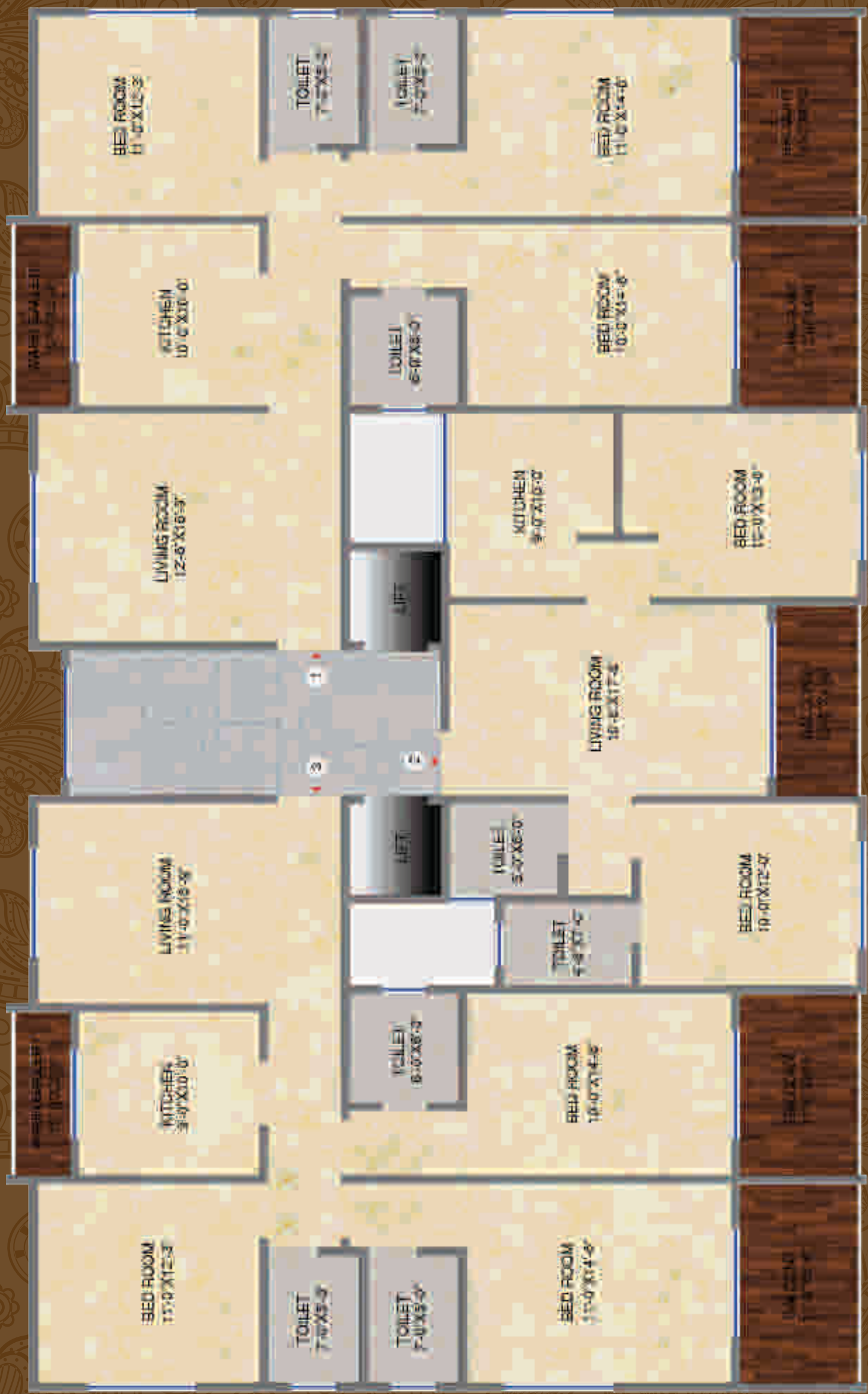
1st To 6th FLOOR PLAN